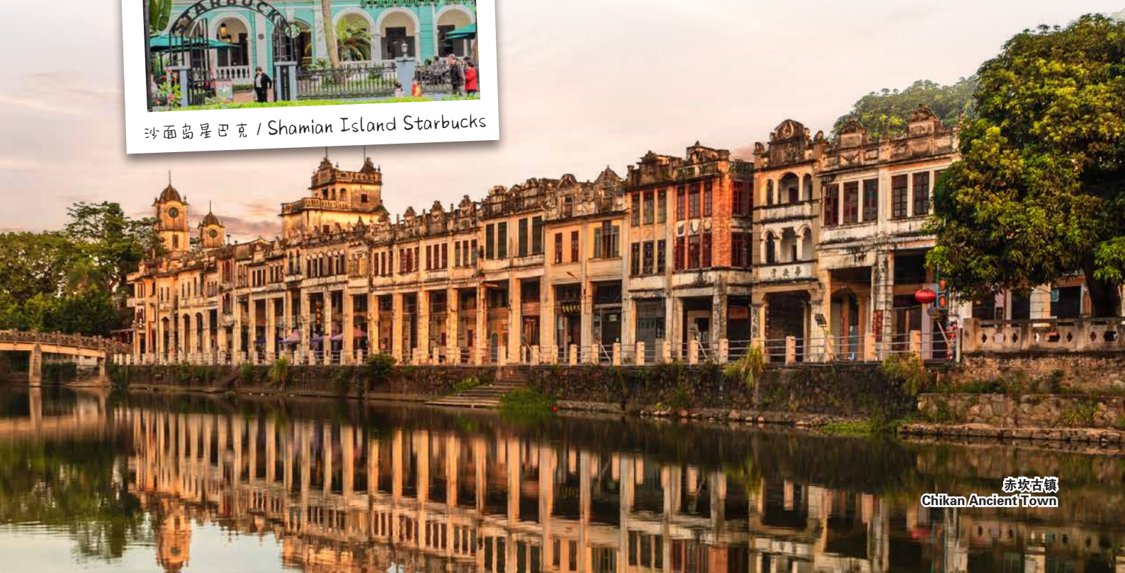
赤坎古镇 Chikan/Ancient Town