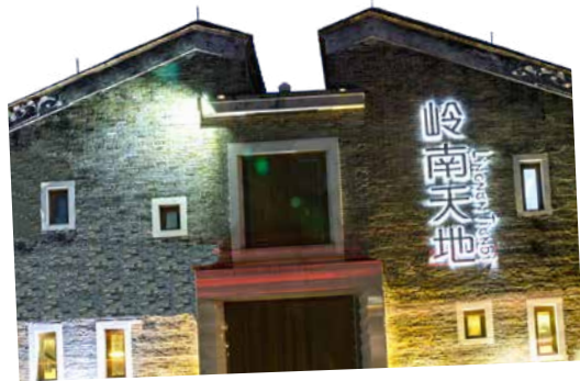
岭南天地 / Lingnan Tiandi