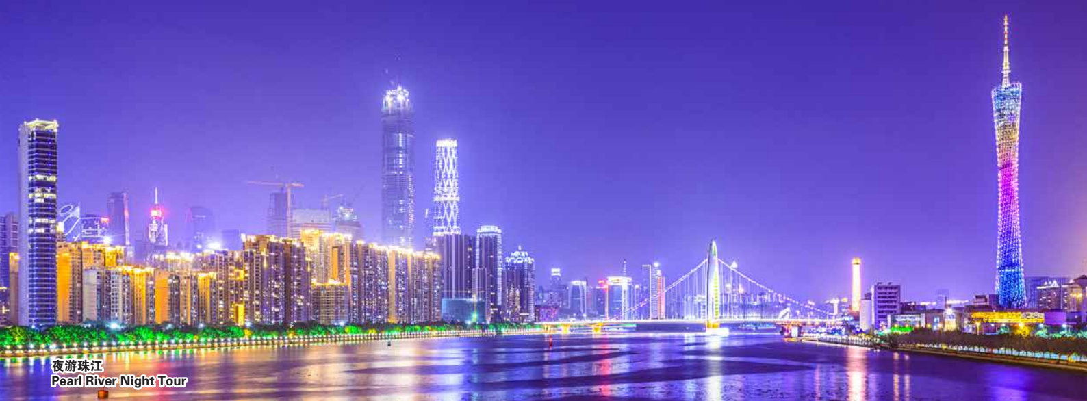
夜游珠江 Pearl River Night Tour