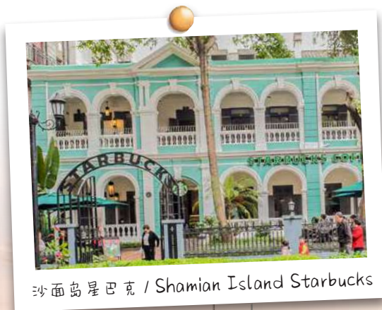
沙面岛星巴克 / Shamen Island Starbucks